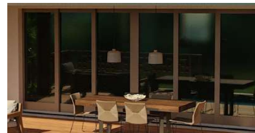
Exterior Sliding Door