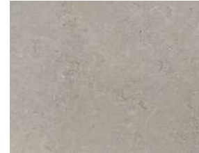
Floor & Bathroom Wall Tiles