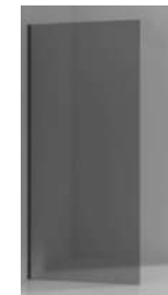
Shower Glass Divider